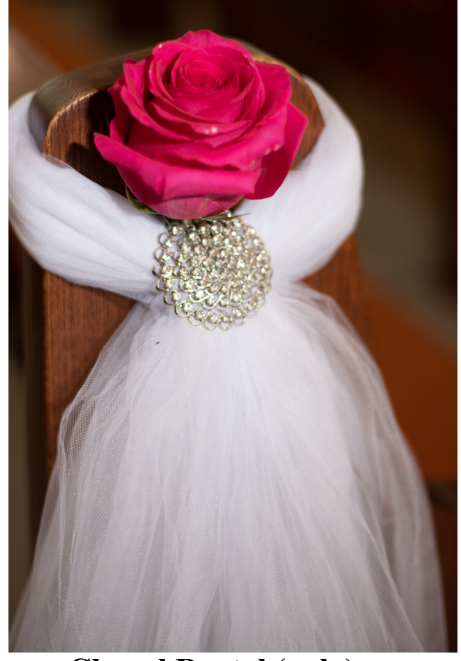
Chapel Rental (only) Weddings Includes rehearsal time for wedding. This does not include décor

Chapel Rental Funerals Church services Concerts etc.